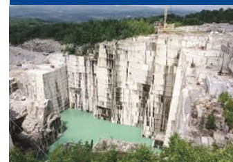
Rock of Ages Granite Quarry