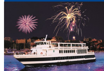
Dinner Cruise on beautiful Lake Champlain

COLD HOLLOW CIDER MILL ® Cold Hollow Cider Mill