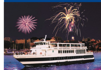
Dinner Cruise on beautiful Lake Champlain

COLD HOLLOW CIDER MILL ® Cold Hollow Cider Mill