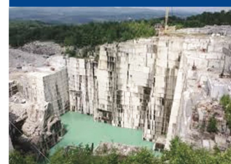
Rock of Ages Granite Quarry

Diamond Tours ® inc. Bringing Group Travel to a Higher Standard ®